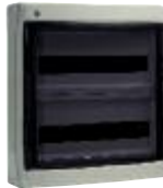
ICB-3665 36-Slot (2 x 18 Slots)