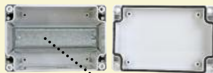
Optional DRxxxxxE Steel DIN-rail