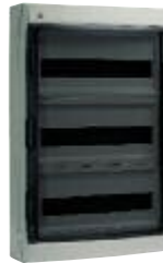
ICB-5465 54-Slot (3 x 18 Slots)