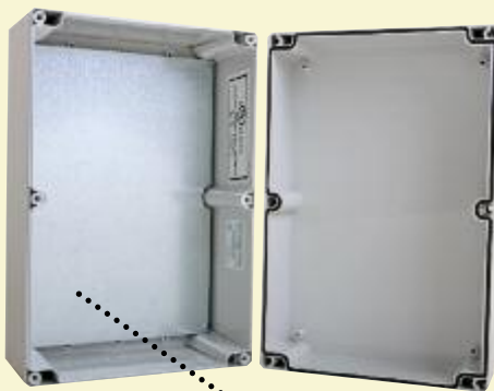
Optional DMPxxxxE Steel Sub-panel