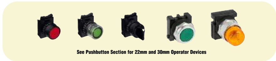
See Pushbutton Section for 22mm and 30mm Operator Devices